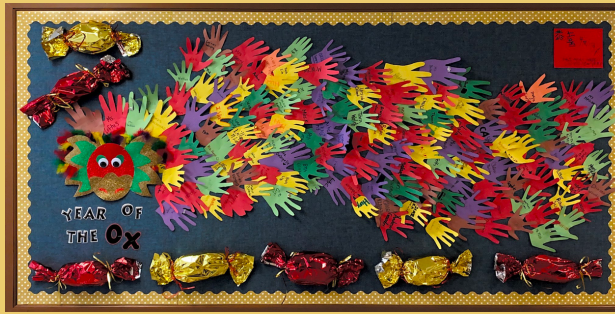
Lunar New Year Beechwood Elementary School