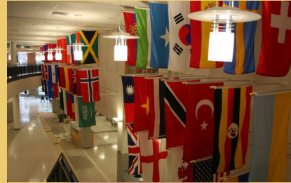
Hall of Flags, Quincy High School