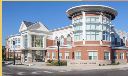
Central Middle School

Visit our website at quincypublicschools.com