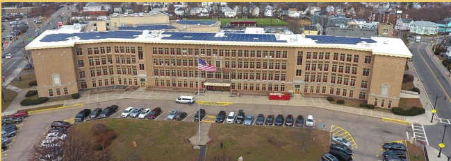
North Quincy High School